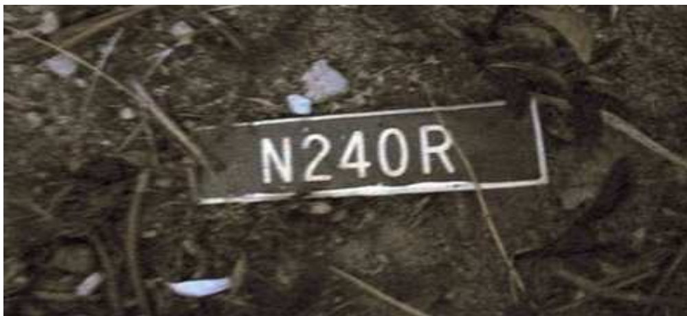
Wreckage from Fossett's plane showing his tail number

On September 3, 2007, Steve Fossett left a friend's ranch in a single engine airplane never to be seen again.